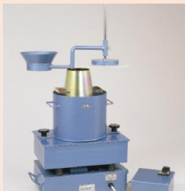
Modified VeBe Apparatus