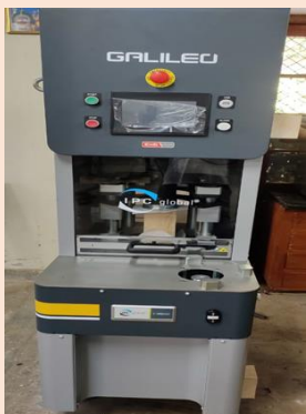
Concrete Gyratory Compactor