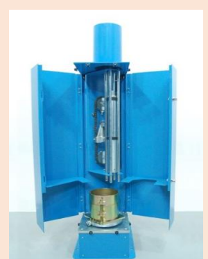
Automatic Modified Proctor