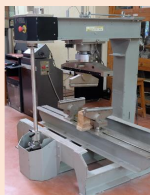
Electro-Mechanical flexural toughness Testing Machine