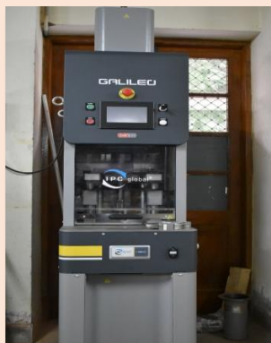
Concrete Gyratory Compactor