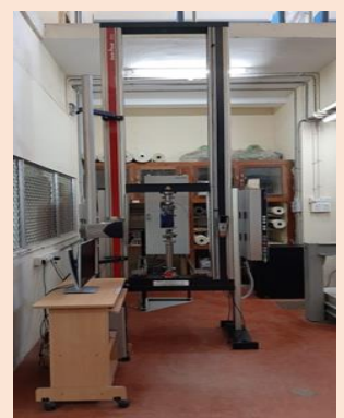
ZwickRoell Electro-Mechanical Testing Machine