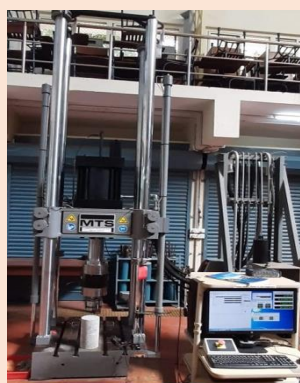
Servo-Hydraulic Compression Machine