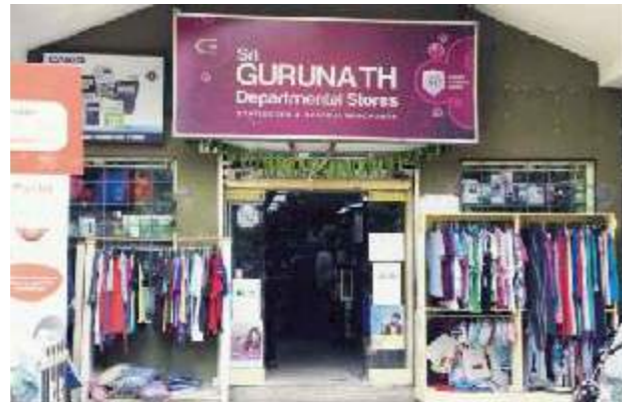
Food Joint / Gift Shop / Departmental Store