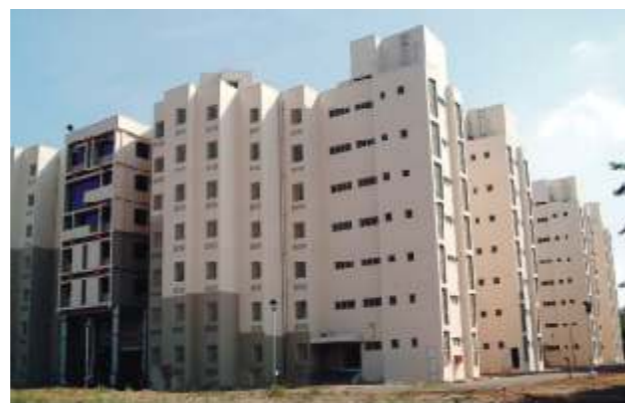
New Hostels (Dormitories)