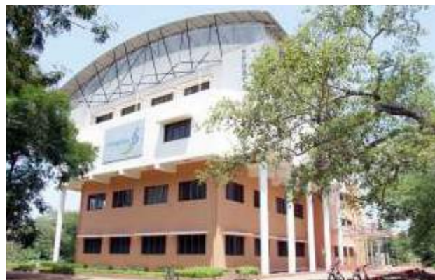
Sports Complex & Fitness Centre