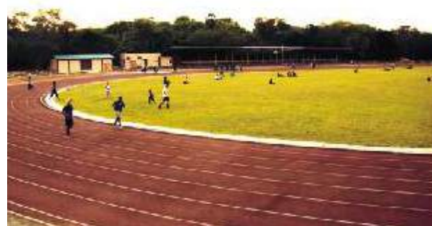
Manohar Watsa Stadium