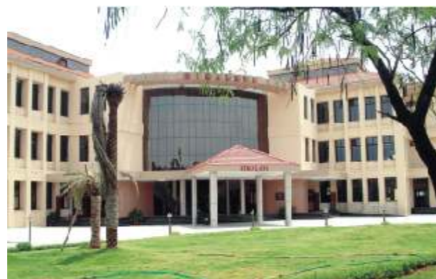
Mega (Himalaya) Mess - Central Dining Facility