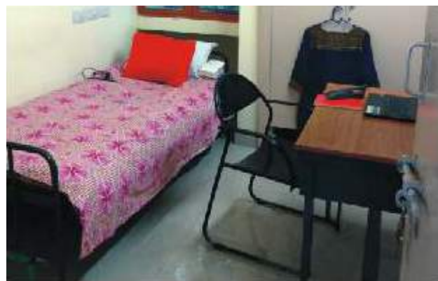
A typical IITian Room